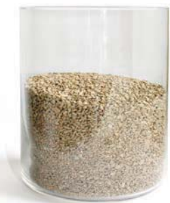
PS85 granular media